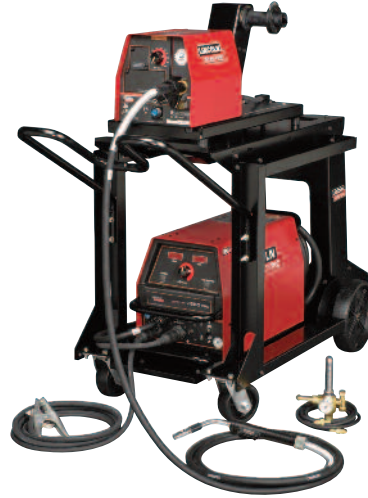
Shown: Invertec® V350 PRO Factory Model/ LF-72 Heavy Duty Wire Feeder Ready-Pak®